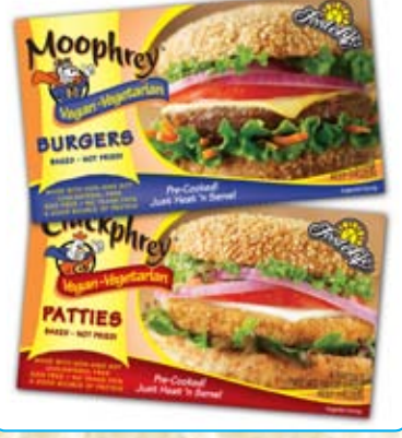
Cluckphrey® and Moophrey® vegan burgers and patties are the newest addition to the Food for Life family

For more information about Food for Life visit: www.foodforlife.com Down to Earth is pleased to count Food for Life among its ALL VEGETARIAN Preferred Brands!